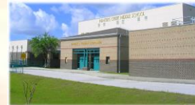
Hunter's Creek Middle School