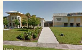
Freedom Middle School